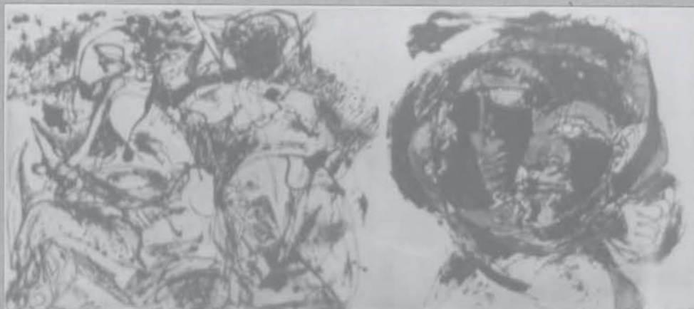
fig 9. PORTRAIT AND A DREAM. Jackson Pollock, 1953. (oil on canvas).