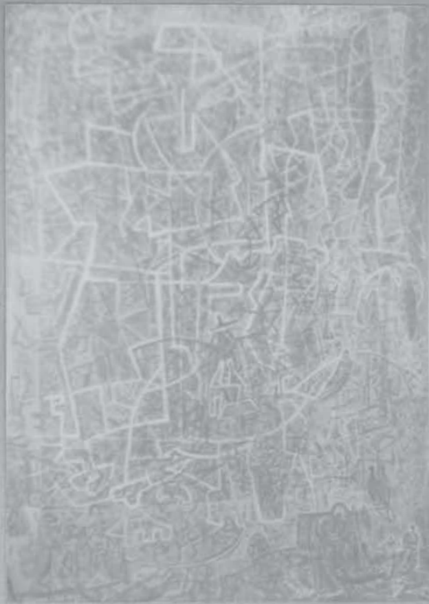
fig 10. DORMITION OF THE VIRGIN. Mark Tobey, 1945. (oil on canvas).