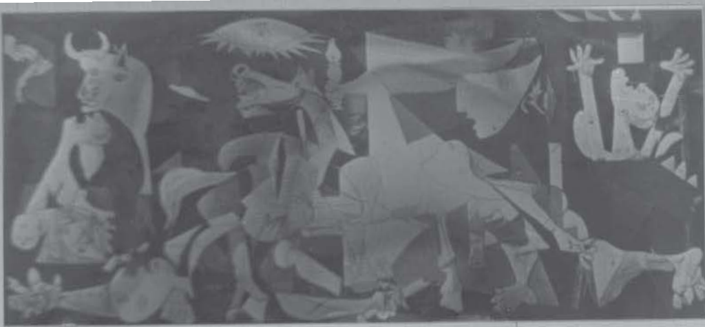
fig 3. GUERNICA. Pablo Picasso, 1937. (oil on canvas).