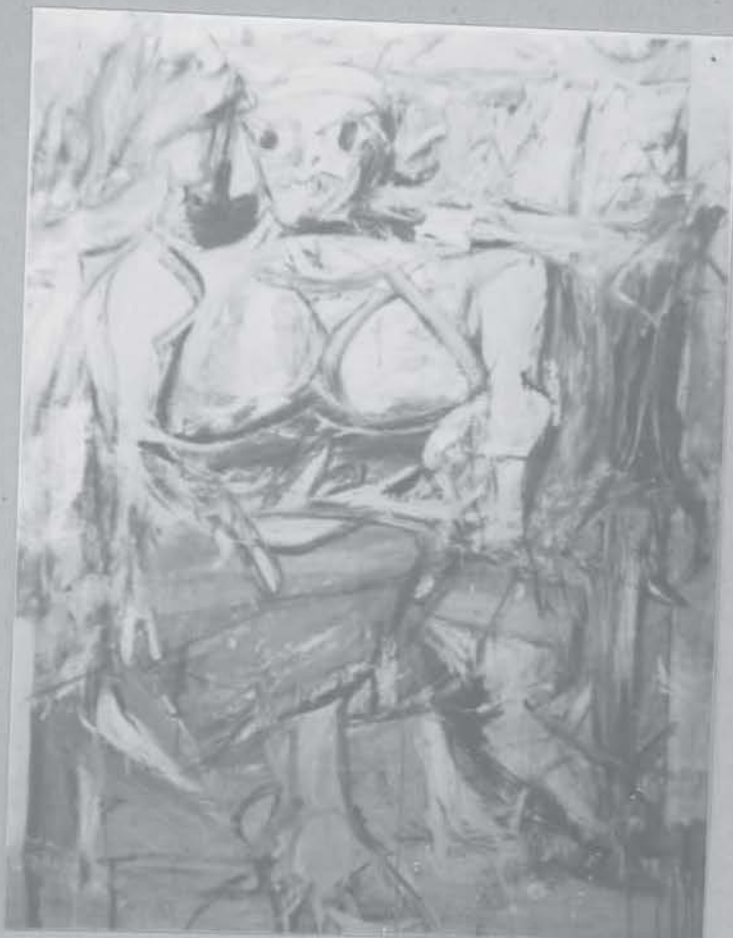
fig 8. WOMAN 1. William De Kooning, 1950-52. (oil on canvas).