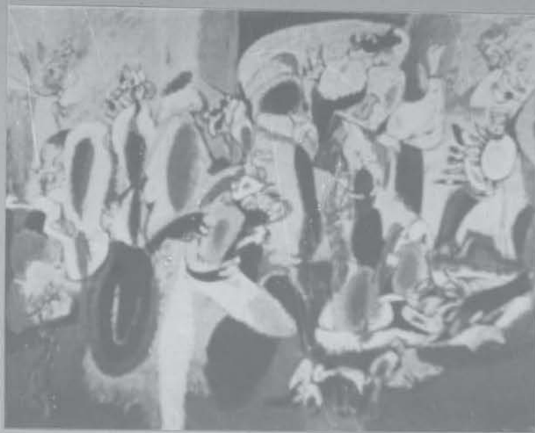
fig 7. THE LIVER IS THE COCKS COMB. Arshile Gorky, 1944. (oil on canvas).