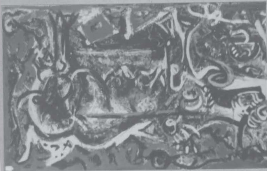
fig 6. SHE WOLF. Jackson Pollock, 1943. (oil on canvas).