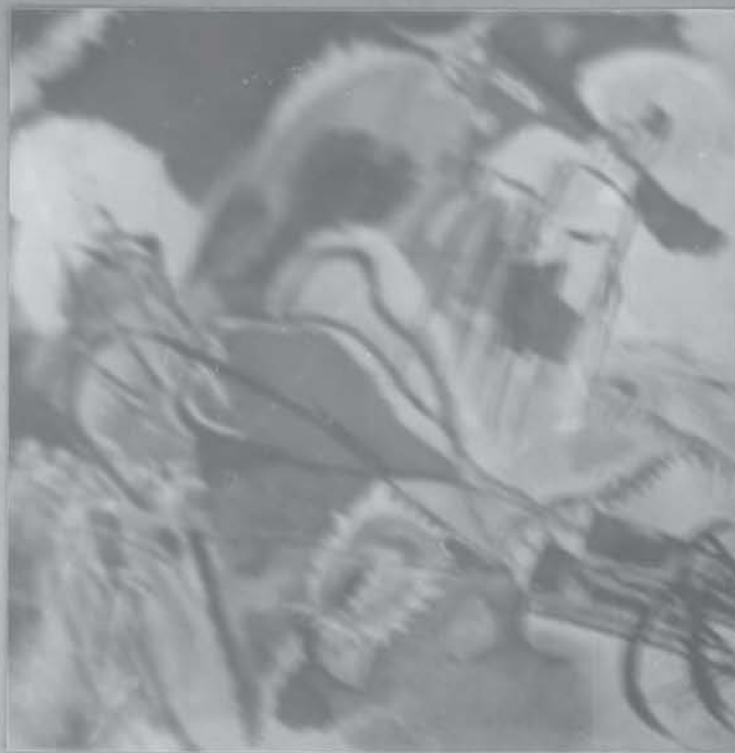
fig 1. IMPROVISATION # 30. Wassily Kandinsky, 1913. (oil on canvas).