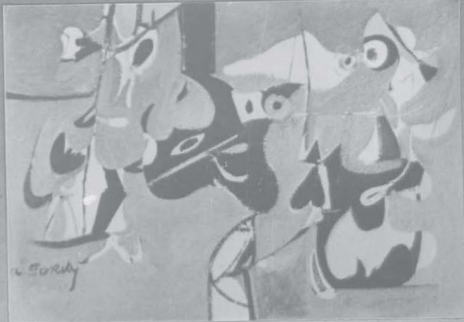
fig 5. GARDEN IN SOCHI. Arshile Gorky, 1940. (oil on canvas).