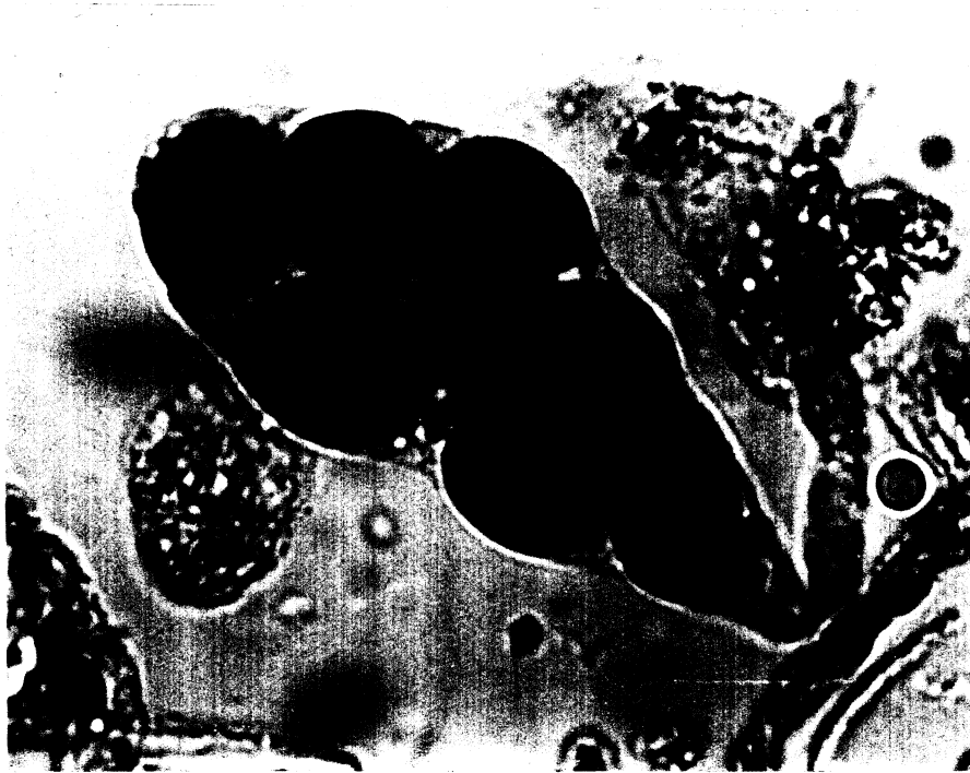
Figure 7. Ascus with 8 mature ascospores (x500).