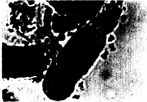
Figure 2. Young developing ascogenous hypha (x500).