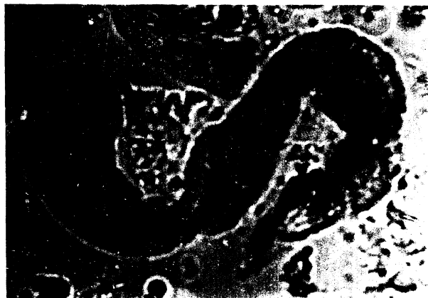
Figure 3. Metaphase of mitosis in ascogenous hypha showing mitotic synchronization. Each set of 7 chromosomes are separated by a septum (x500).