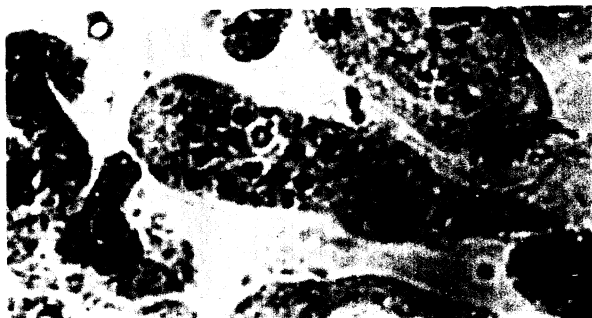
Figure 6. Ascogenous hypha possessing 14 chromosomes. Note elongation of hypha (x500).