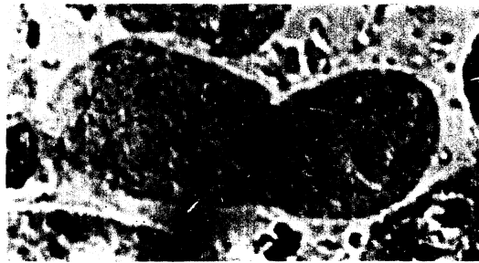
Figure 5. Ascogenous hypha possessing 14 chromosomes (x500).