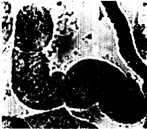
Figure 4. Incomplete mitosis in ascogenous hypha. Note the center cell is still synchronized in mitosis; each contains 14 chromosomes (x500).