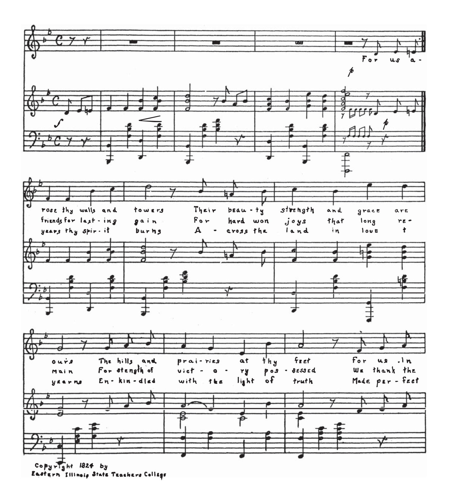
Music by Frederic Koch