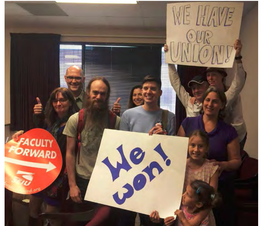
NTT faculty at Duke, after voting to form a union in 2016