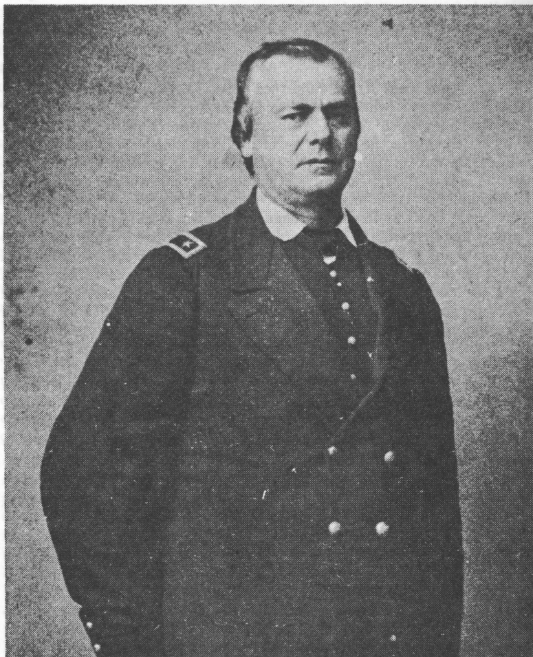
Colonel Richard James Oglesby, Commander, First Brigade, First Division, U. S. Grant's Army. Illinois' only three-term governor was photographed here in his general's uniform.