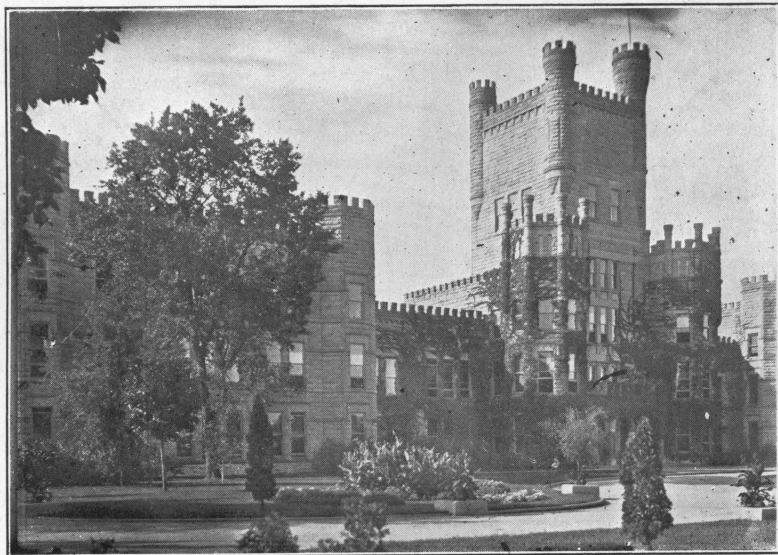
The Eastern Illinois State Normal School, Charleston, Illinois

The Summer Session begins June 15 and ends July 24, 1914