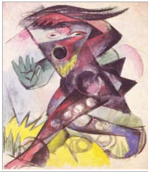
"Caliban" Franz Marc, 1914

Office Hours in Coleman Hall 3556: Mon 11a.m. to 12 noon and Fri 9 a.m.- 10a.m. or by appointment Faculty Development Office: Booth Library Basement room 1116 Email: dabredesen@ciu.edu Phone: 217-581-7051