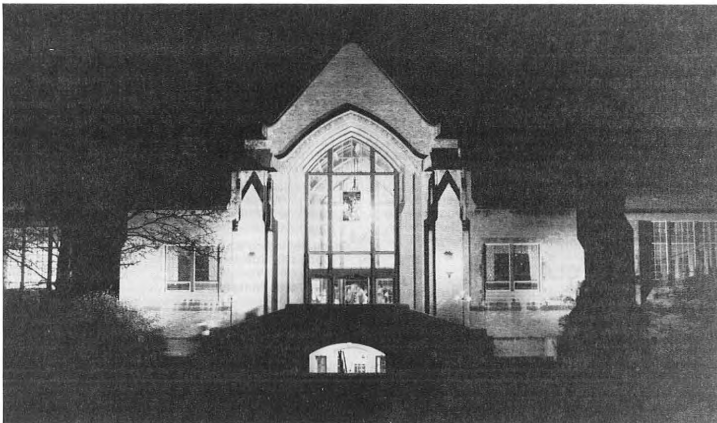
Main entrance of Booth Library.