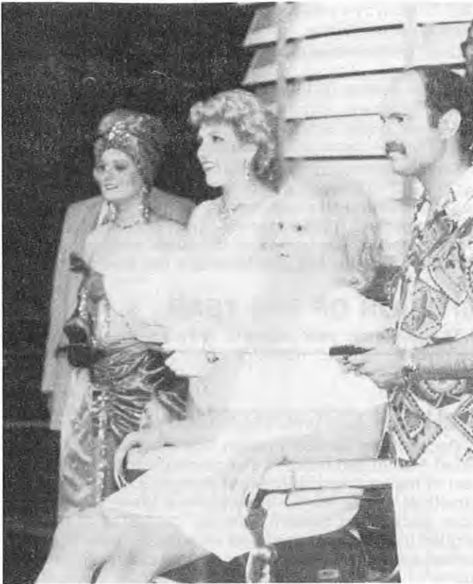
Play cast members receive applause from audience at the John F. Kennedy Center for the Performing Arts in Washington, D.C.