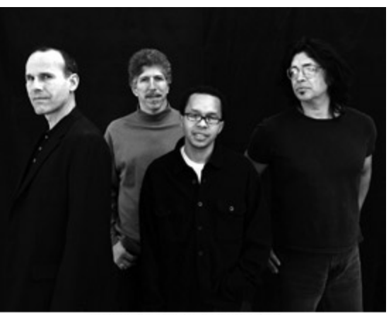
Yellowjackets Jazz Quartet

The Doudna is located one block west of Ninth Street at Garfield Avenue on the EIU campus. Free parking is available in the any of the university lots found at the corner of Ninth and Garfield and immediately south of the center.