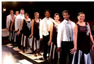
Cole cast line up, Oct.2005