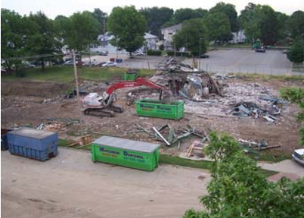
June 6, 2005 – Down went the Health Services building