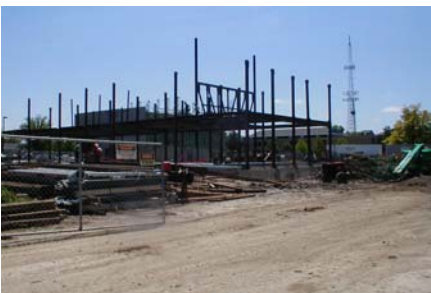
May 17, 2006 – Up go the steel structures

In addition to administrative and faculty offices and general classrooms, key elements of the new facility will be: