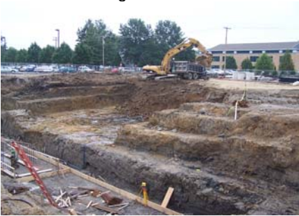
September 9, 2005 – In came contractors to dig out our "space"