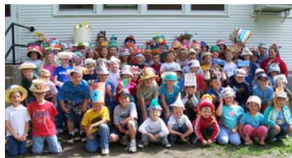
Bishop Creek Grade School "Hats Off to Education Day" inspired by hats in Aladdin

Plans are to continue the tradition of a children's performance with a week of daily performances at the Village Theatre. Spring 2007 The Frog Prince , will be presented April 16-21.