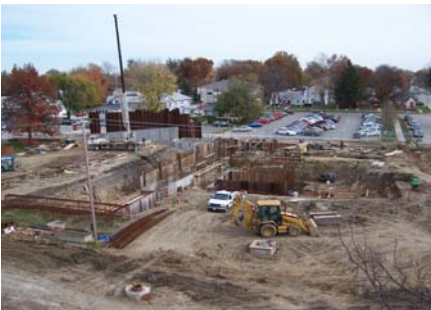
November 11, 2005 – Up go concrete brick walls and foundations.