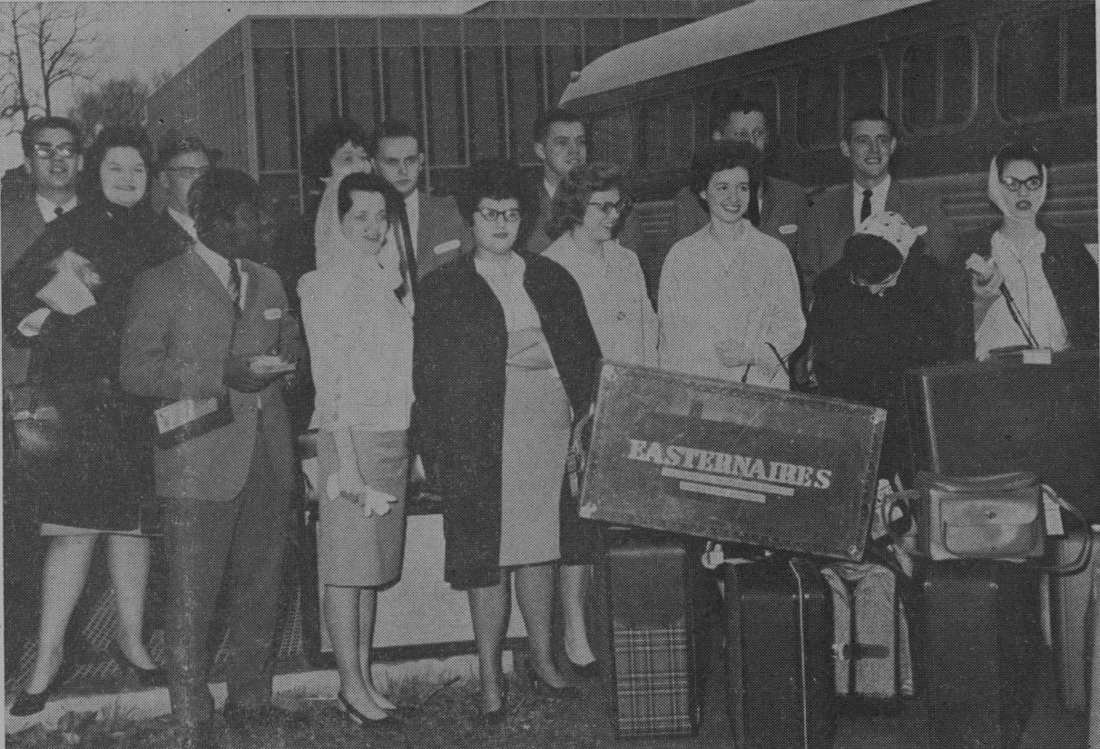
"Glad to say we're on our way, won't be back for many-a-day."