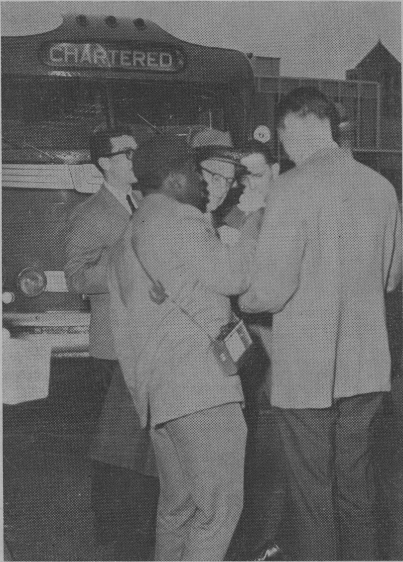
"Now, boys, I promised their mothers . . ."