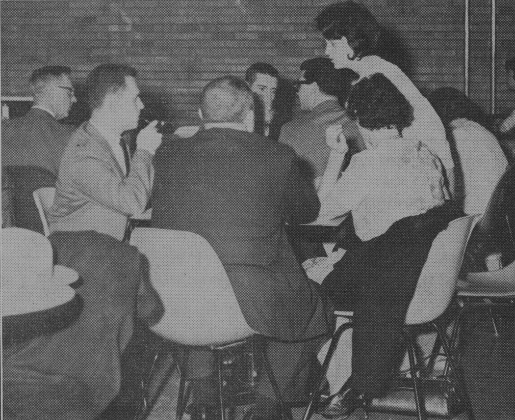
"What's this about a misplaced piano?"