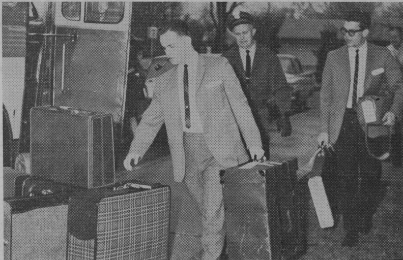
"Say, how big is that plane?"