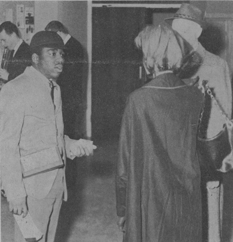
"If I don't come back with the others . . ."