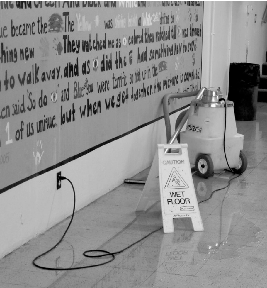
McKinney Hall has flooded every time it has rained this summer. The water is leaking from the first floor and into the basement.