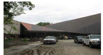
(New entrance to the Doudna Fine Arts Center. Theatre is to the right)