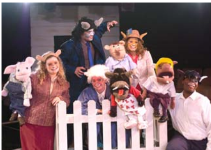
(Puppets telling their side as the wolf hovers above.)

The humorous presentation was enjoyed by children and adults.