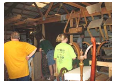
(Summer crew works on cleaning out and arranging the Theatre storage unit, located near O'Brien Stadium)