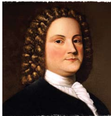
Exhibit opens January 12, 2011 and runs through February 25, 2011

The American Library Association (ALA) Public Programs Office, in collaboration with the National Endowment for the Humanities and the Benjamin Franklin Tercentenary, is sponsoring the traveling exhibition, "Benjamin Franklin: In Search of a Better World." The exhibit will give public audiences the opportunity to explore and to talk about Franklin's life, his contributions to the founding of this country, and his high standards for work, citizenship, and contribution to community. It will look at his background, his self-education, and his philosophical and religious beliefs and their effect on his work and life. It will show Franklin in the context of the eighteenth century and as a product of his times—a brilliant and rather unconventional product of his times—rather than as the venerable bespectacled and grandfatherly figure with whom we are all familiar.