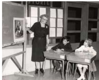
Exhibit opens October 2010 and runs through November 2010

This locally produced exhibit from Booth Library explores the development and history of teacher training schools, known as Normal Schools. Artifacts from the nineteenth and twentieth century that exemplify differing styles and systems of education and learning will be on display, along with historical photos and documents, focusing on Eastern Illinois University and its roots.