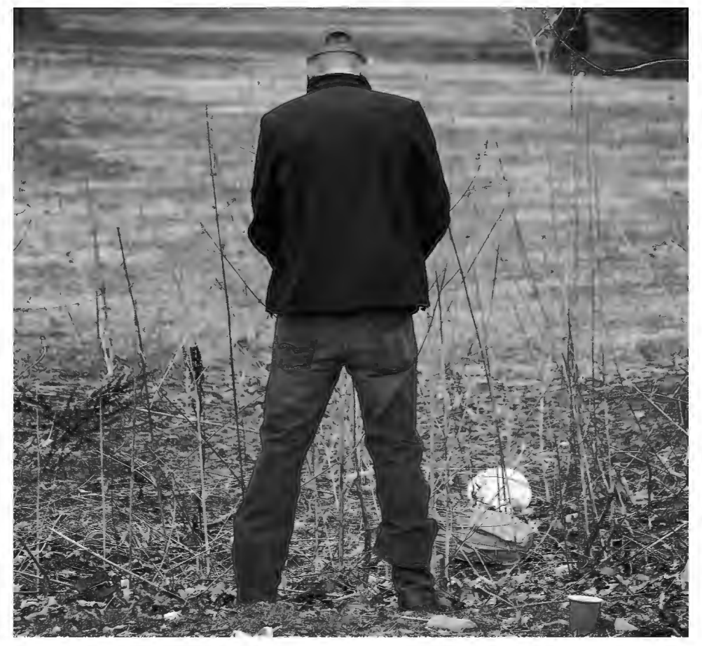
A individual urinates in a backyard at the second house on the house party crawl for Unofficial 2022. He was later cited by police for the alleged offense.