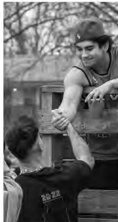
BY ROB LE CATES | THE DAILY EASTERN NEWS Partygoers socialize at the second house of the Unofficial 2022 house crawl.