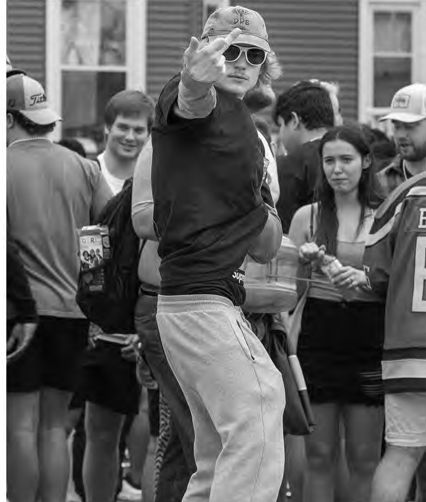
BY ROB LE CATES | THE DAILY EASTERN NEWS

Participating in Unofficial, you open yourself up to a lot -- future (or current) employers seeing photos you or someone else posts