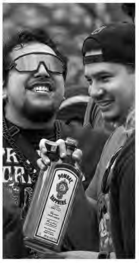
People party at the second house of the Unofficial 2022 house party crawl.