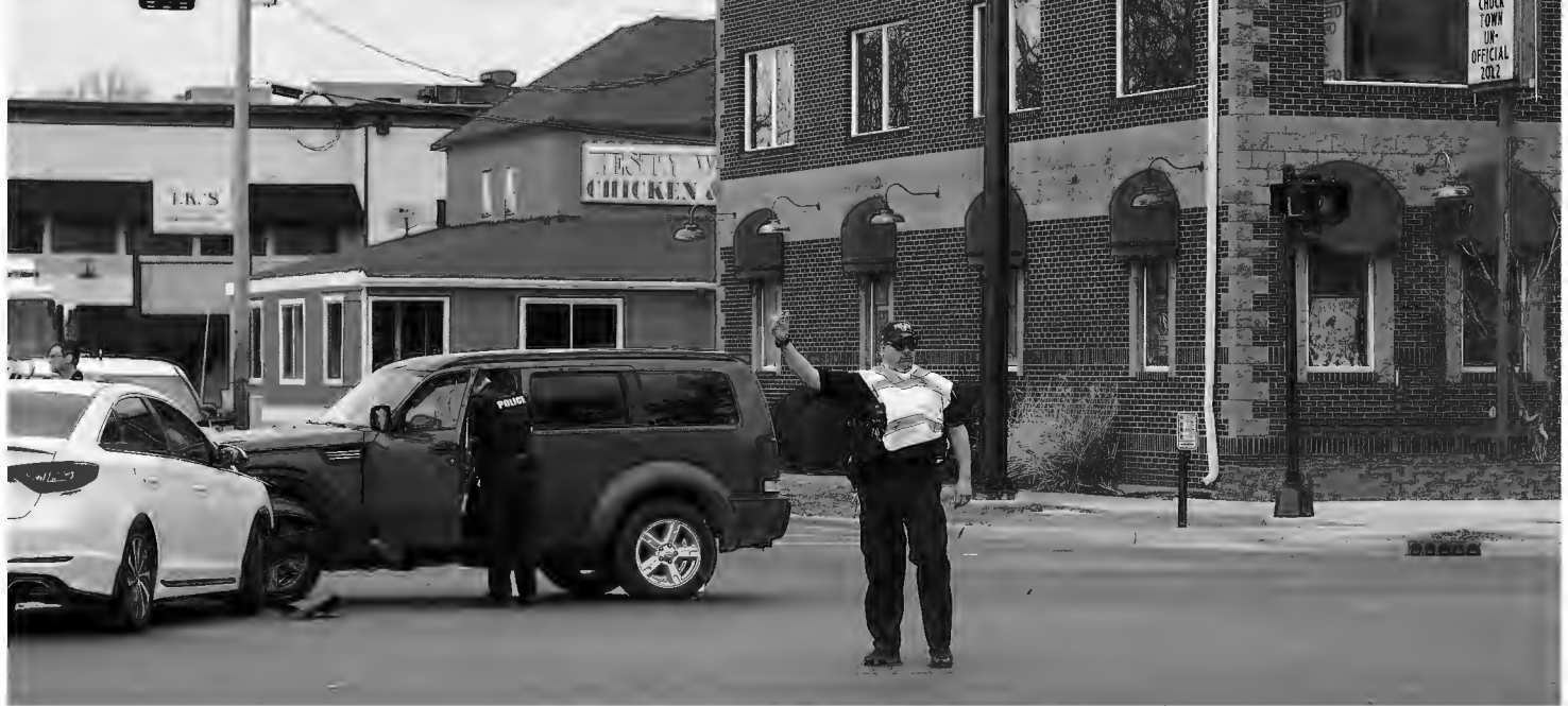
BY ROB LE CATES | THE DAILY EASTERN NEWS