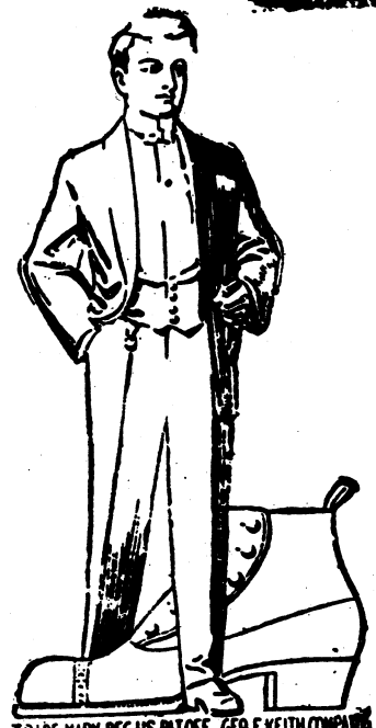
TRADE MARK REG. U.S. PAT. OFF. GEO. E. KEITH COMPANY Mitchell Bros.