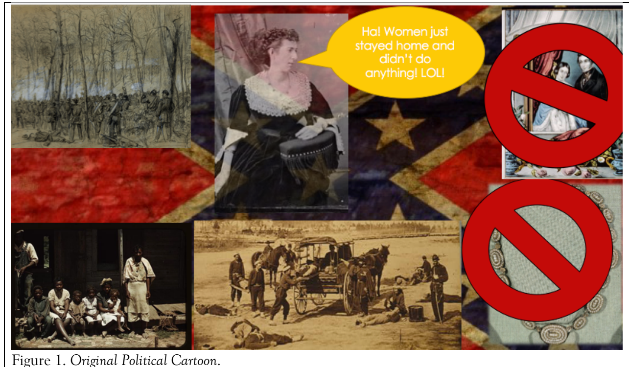
Figure 1. Original Political Cartoon.

Students' OPCs represent creative expressions of newly generative understandings. To distinguish students' intent and effort, teachers can require students to detail in writing the messages encoded through symbolism and integration of text and visual imagery. It would perhaps be problematic to grade students' creativity, the complexity of their creative expression, or the novelty of their creativity; contemporary education initiatives, however, prescribe text-based writing. Teachers should instead assess students' critical and historical thinking through the historical argumentation emergent within document-based writing. Figure Two, Document-Based Writing , is an illustrative example of one 8 th grade student's historical argumentation; it corresponds directly with Figure One, Original Political Cartoon .